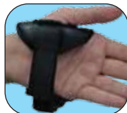
Tighten by pulling the velcro