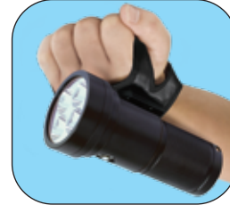
Goodman glove for hands-free operation